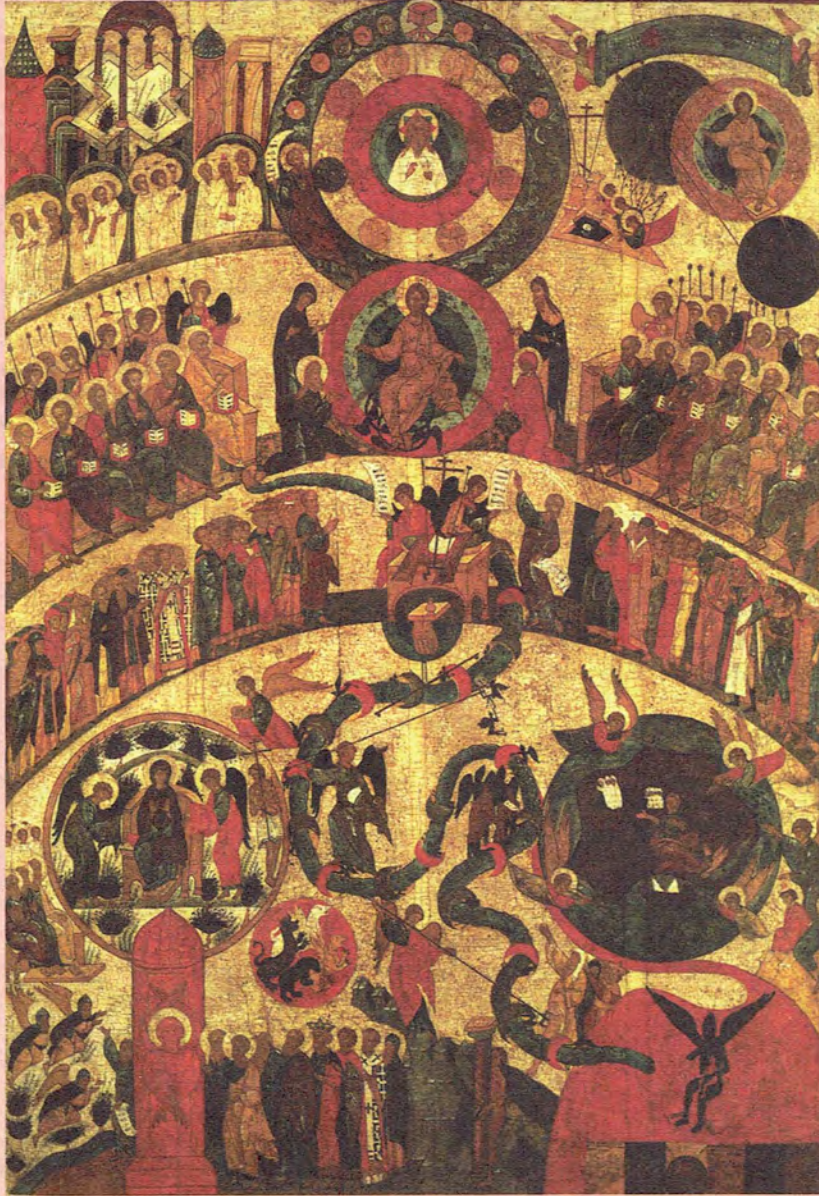
Icon of the Last Judgment